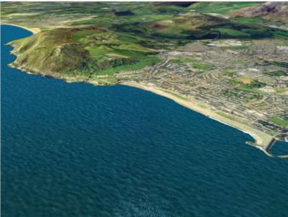
Bray coast view. Happy flight!