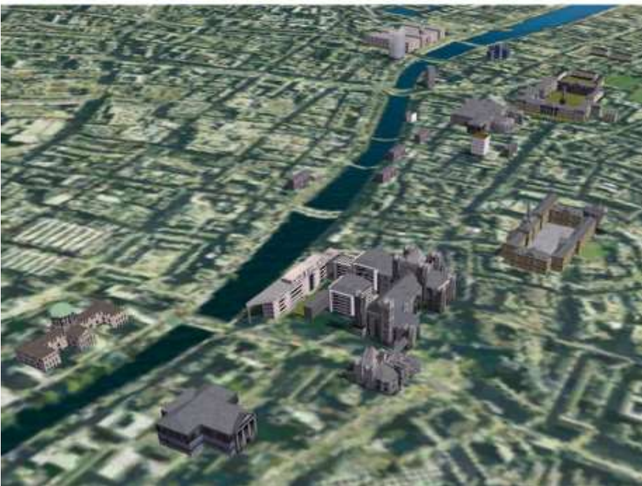
Dublin city centre